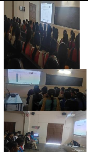
Industry Expert Session for I & E Skill Development