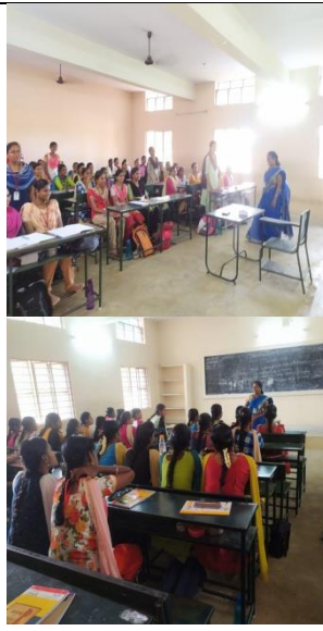
Design Thinking Methodologies