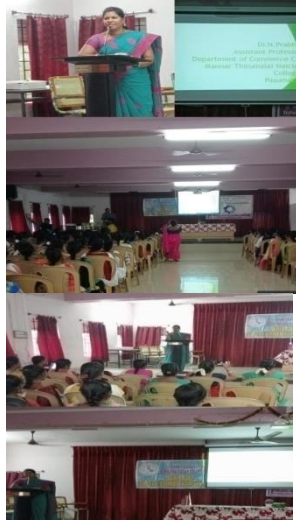
Empowering Women Entrepreneur