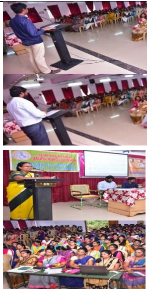
Awareness Program on “Tamilnadu Student Innovators 2022”