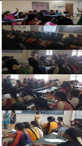
Workshop On Enhancing Problem Solving Skills