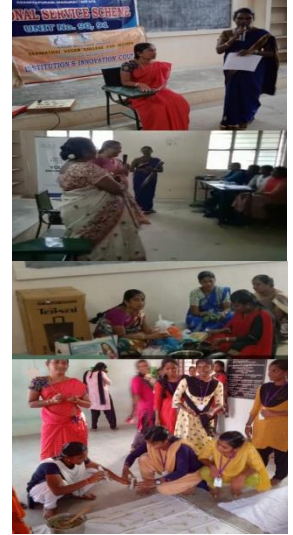
Entrepreneur Skill Development Workshop