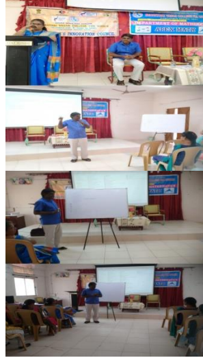
Session On Problem Solving Technique