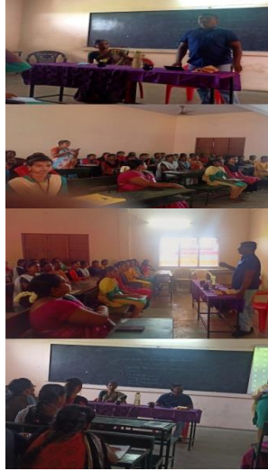
Entrepreneurship Attitude Development