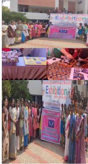
Exposure Visit to International Business Leaders Meet and Exhibition