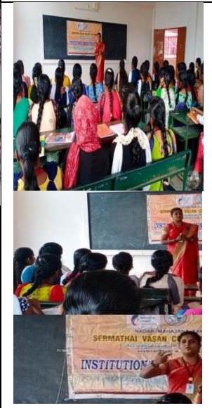
Process of Innovation Development