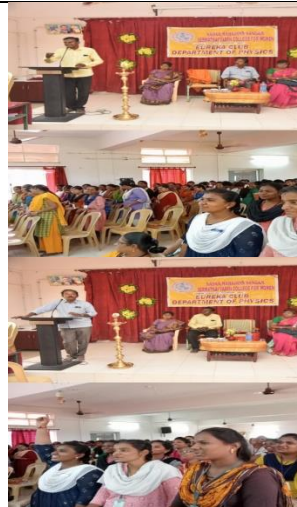
Science of Today – Technology of Tomorrow