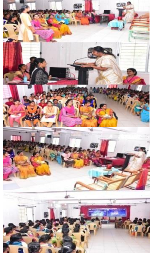
“Becoming an E-Access Expert & Cracker”