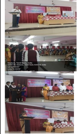
Role of Entrepreneurship @ Mixed Economy