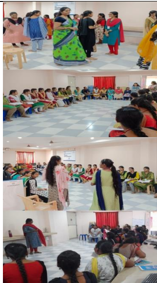
Workshop on Critical Thinking