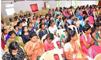
“Achieving Business – Fit to Market”