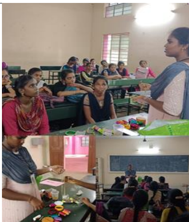
Hands-On Training on Making Silk Thread Ornaments