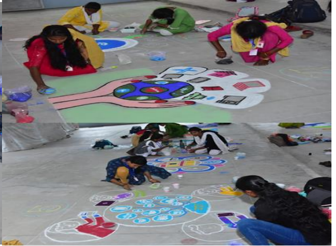
Role of Creativity in Fostering Innovation – Rangoli Competition