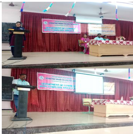
Transferring Startup into Entrepreneurship