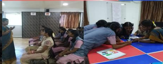
Hands on Training on “Electronic Circuits”