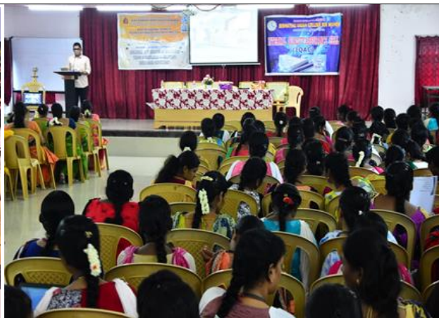
Session on “Challenges in Environmental Issues & Trends in Sustainable Development of G20”