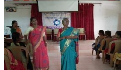
Mastering Technologies in current scenario-Boosting Innovation