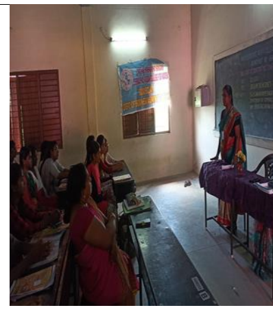
Business Plan Preparation