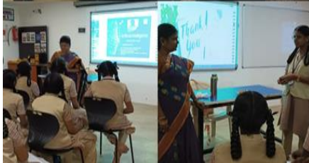
Seminar on “Artificial Intelligence”