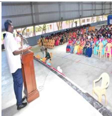
Innovation Leads Start Up