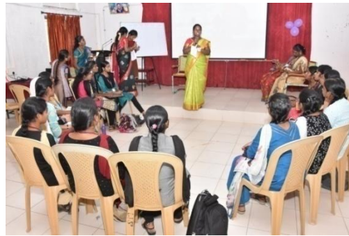
Organize an Inter/Intra Institutional Business Plan Competition and Reward Best Innovations.