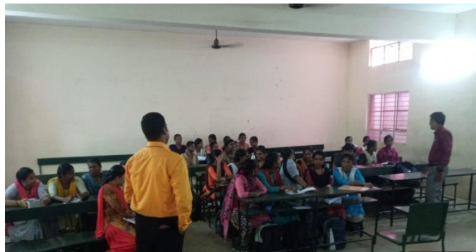
Mentoring Event: Demo Day/Exhibition/Poster Presentation of Business Plans & linkage with Innovation Ambassadors/Experts for Mentorship Support.