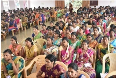
Workshop on Intellectual Property Rights (IPRs) and IP management for start up