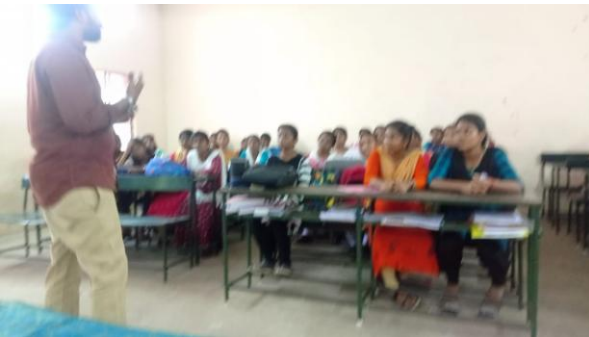
Session on Innovation/Prototype Validation – Converting Innovation into a Start-up or Session on Achieving “Value Proposition Fit” & “Business Fit”