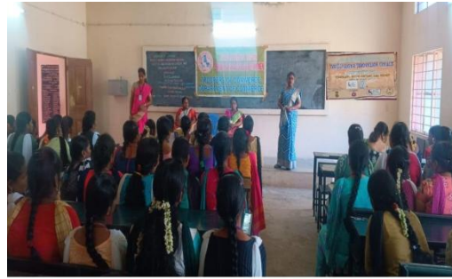
Session on “How to plan for Start-up and legal & Ethical Steps”