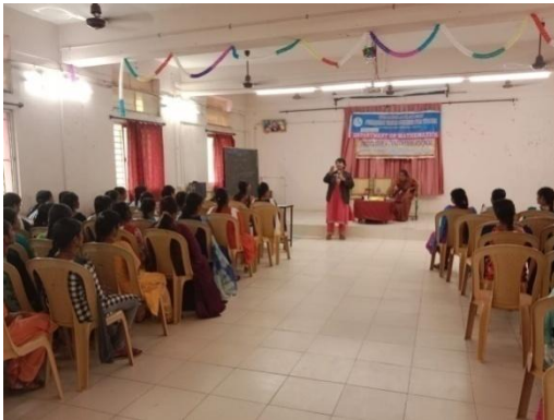
Session/ Panel discussion with innovation and Start-up Ecosystem Enablers from the region/state/national level