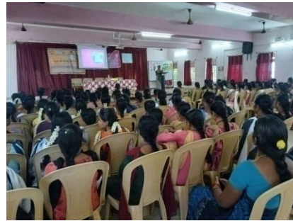
Session on Angel Investment/VC Funding Opportunity for Early-Stage Entrepreneurs.