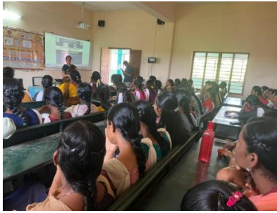
Organize Session on “Lean Start-up & Minimum Viable Product/Business”- Boot Camp (or) Mentoring Session