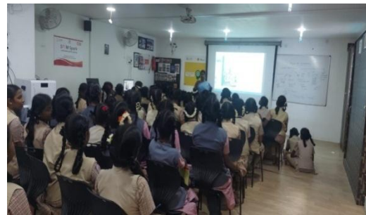
Organizing Innovation & Entrepreneurship Outreach Program in Schools/Community