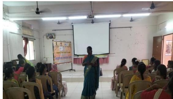
Session on Accelerators/Incubation - Opportunities for Students & Faculties - Early- Stage Entrepreneurs