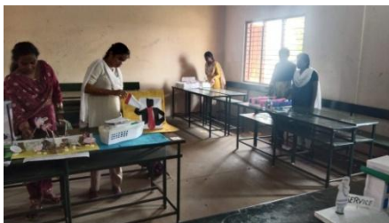
Organize an Inter/Intra Institutional Start-up Competition and Reward Best Start-ups.