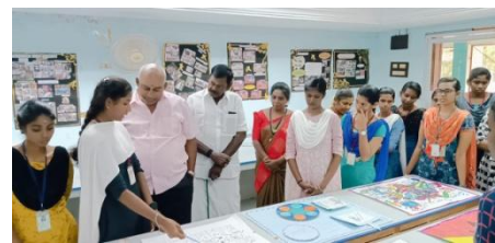
Mentoring Event: Demo Day/Exhibition/Poster Presentation of Business Plans & linkage with Innovation Ambassadors/Experts for Mentorship Support.