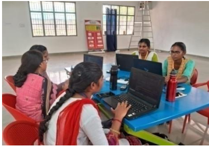
Field/Exposure Visit to Incubation Unit/Patent Facilitation Centre/Technology Transfer Centre such as Atal Incubation Centre etc.