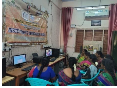
Live Session on “Inauguration of IP UTSAV and Celebration of World Creativity and innovation”