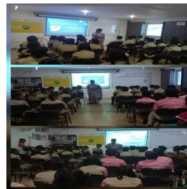
Prototypes & linkage with Innovation Ambassadors/Experts for Mentorship Support