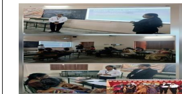
Organize an Inter Institutional Business Plan Competition