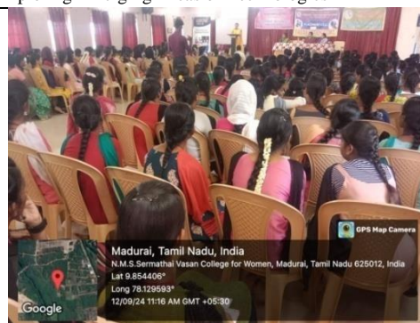
Workshop on “Entrepreneurship & Innovation” as a career Opportunity