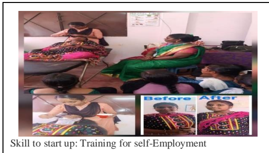
Skill to start up: Training for self-Employment