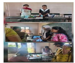
Inter-Institutional Idea Competition – “Innovative IoT Home Automation”