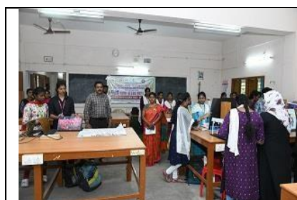
Organize an Intra Institutional idea presentation