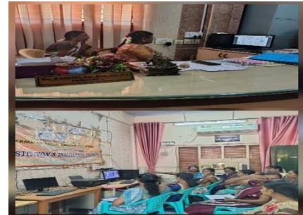
Live Session on “Significance of IP Protection and Commercialization ”