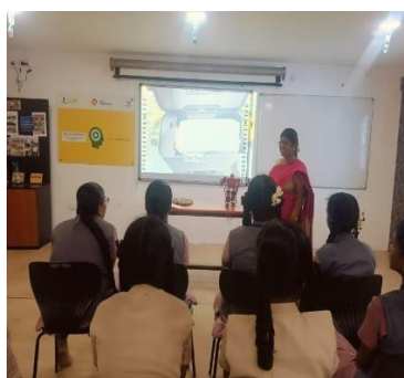
Organizing Innovation Outreach Program in Schools by engaging active Atal Tinkering Labs and School Innovation Council (SIC)