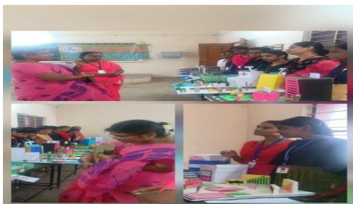
Organize an Intra Institutional Innovation Competition