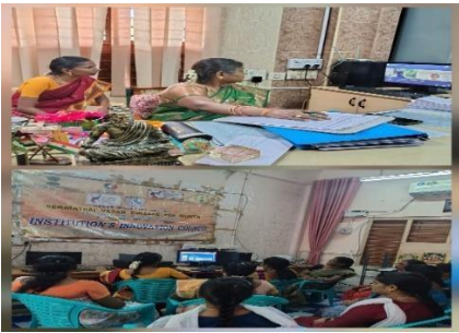
Copy That! Copyrights Uncovered: Masterclass on Copyrights.