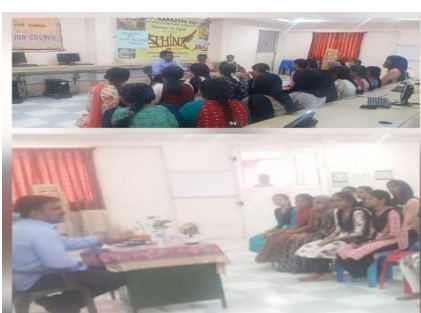
Session with innovation and Start-up Ecosystem Enablers from the region