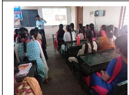
Session on “How to plan for Start-up and legal & Ethical Steps”