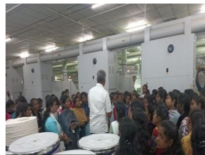
Field/Exposure Visit to Pre-incubation units such as AICTE Idea Lab, Fab lab, Makers Space, Design Centers, City MSME clusters, workshops etc.