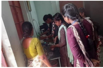
Hands on workshop: Learning the Art of Baking