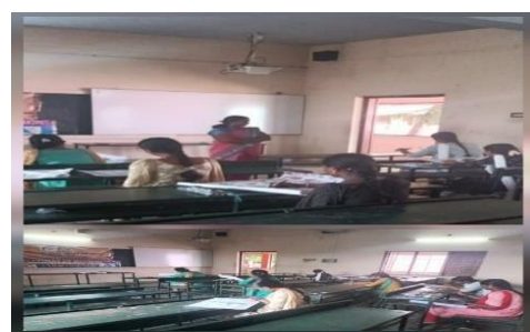
Poster Presentation of Business Plans