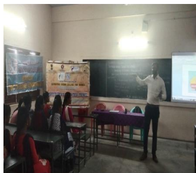
Workshop on Effective Sales and Marketing Strategies for Entrepreneurs /Startups