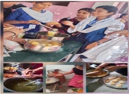
Entrepreneurial Catering Workshop: Preparing quick Bites and Savories