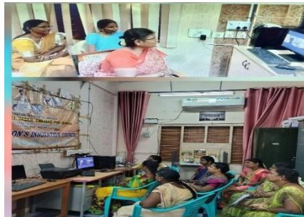
Live Session on “Mark the Spot: Trademarks Talk ”