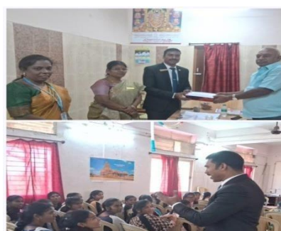
Conduct a Session on Achieving Problem-Solution Fit and Product-Market Fit