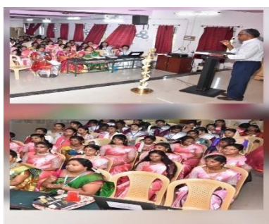
Session on the “Basic Intellectual Property Rights”