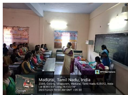
Madurai, Tamil Nadu, India 23.55, Colony, Nilakuram, Madurai, Tamil Nadu 625012, India Lat: 8.88233° Long: 78.133274° 28/07/2025 10:54 AM GMT +05:30 Session on Achieving “Value Proposition Fit” & “Business Fit”