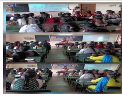
Workshop on “Protecting Intellectual Property Rights”