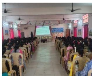
Session on “Empower Students with Future-Ready Skills”