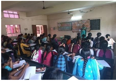
Awareness Program On Student Innovation