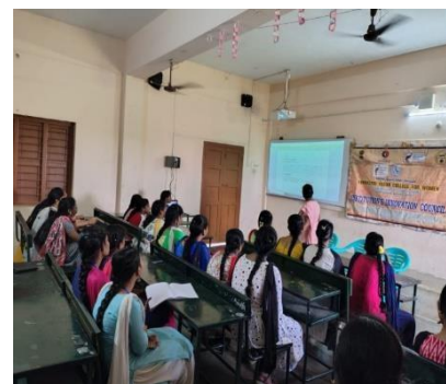
Expert talk on Process of Innovation Development, Technology Readiness Level (TRL )