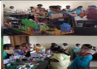
Idea Showcase: Demo Day/Exhibition/PoC& linkage with Innovation Ambassadors.