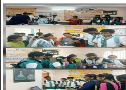
Organizing Innovation Outreach Program by involving ATLS/SICs in Schools