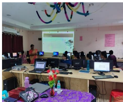
Workshop on Design Thinking, Critical thinking and Innovation Design