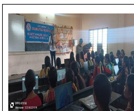
Workshop on Prototype/Process Design and Development