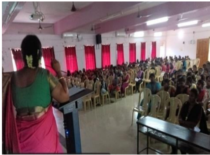
Awareness Programme on MSME Schemes