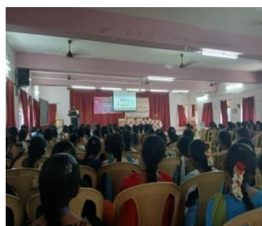
Session on Problem solving and Ideation Workshop