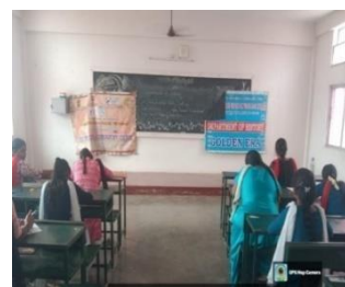
Poster Making Competition – “Women Empowerment”