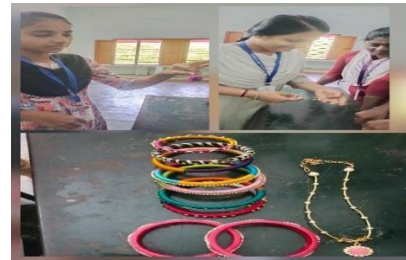
Hands-on Training in Handmade Jewelry Design