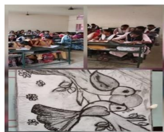
“Exploring creativity through Artistic and Cartoon Illustration”