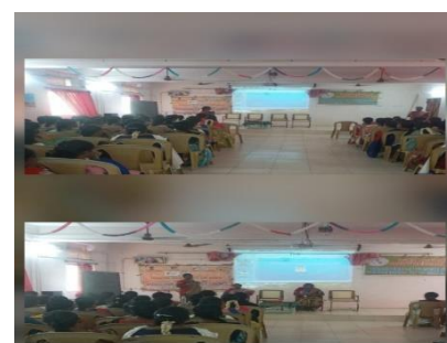
Session on “Lean Start-up & Minimum Viable Product/Business”