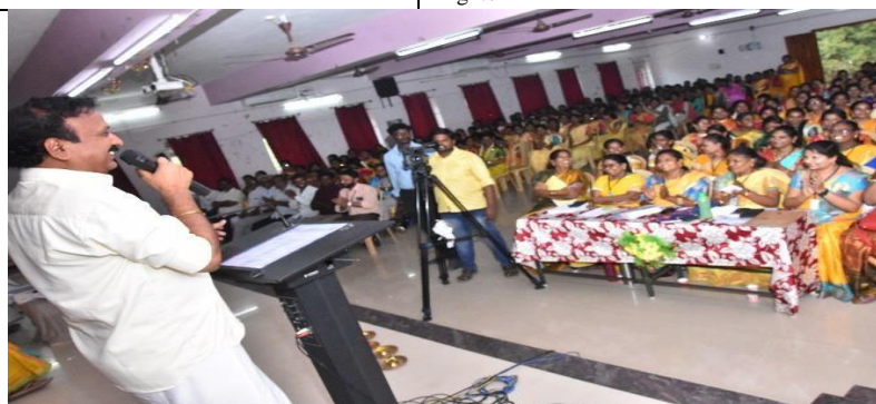
My Story-Motivational Session by Successful Innovators