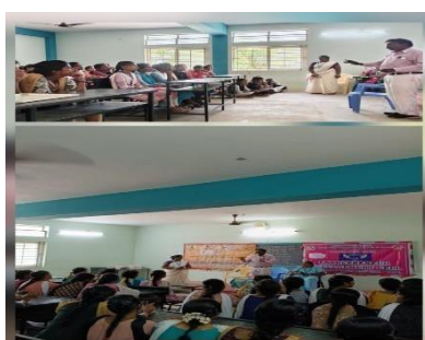
Session on Accelerators -Opportunities for Students & Faculties – Early-Stage Entrepreneurs