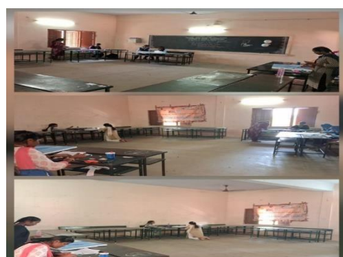
Organize an Inter Institutional Start-up Competition