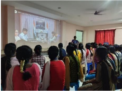
Live Session on “MIC Programmes and Schemes”