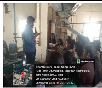
Field/Exposure Visit to Patent Facilitation Centre.