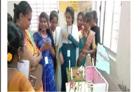
Innovations Inspired by Tamil Heritage - Expo