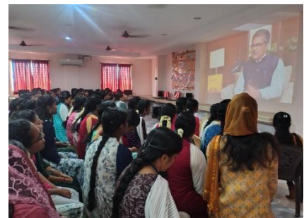
Live Session on “Patent to Product”