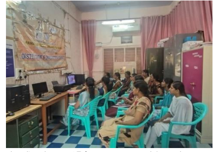
Live Session on “Discover more with Design Registrations”