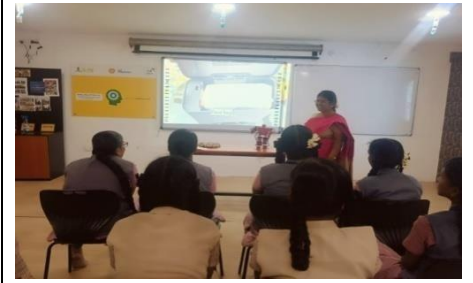
“Introduction to Robotics” to the ATL students