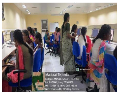
Exposure and Field Visits for Problem Identification: Exploring Emerging Areas of Technologies