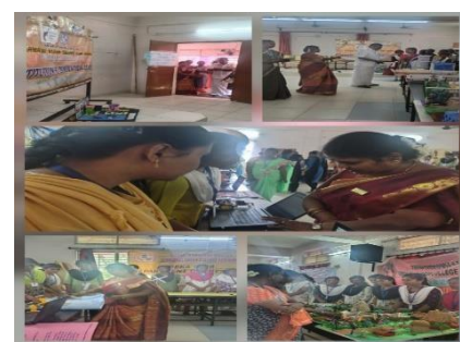
Exhibition & Linkage with Innovation Ambassadors/Experts for Mentorship Support