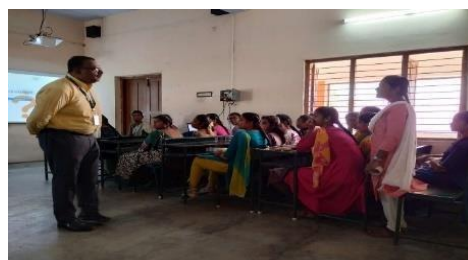
From Idea to Impact - Motivational Session by Successful Entrepreneur/Start-up Founder.