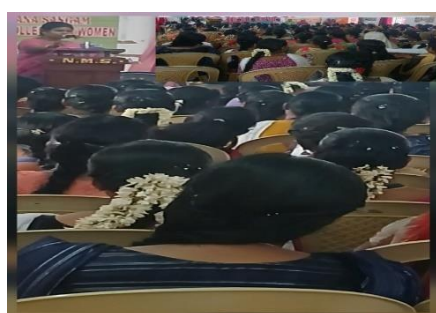
Session on Angel Investment/VC Funding Opportunity Early-Stage Entrepreneurs