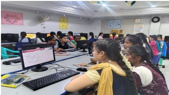
RashtraPratham - Voice That Shape The Nation