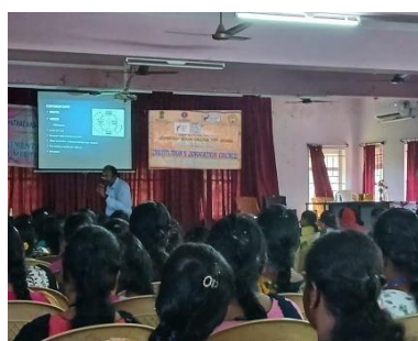
Workshop on “Raising Capital and Managing Finance for Startups”