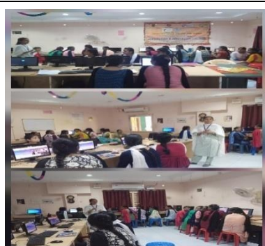
Workshop on Business Model Canvas (BMC)